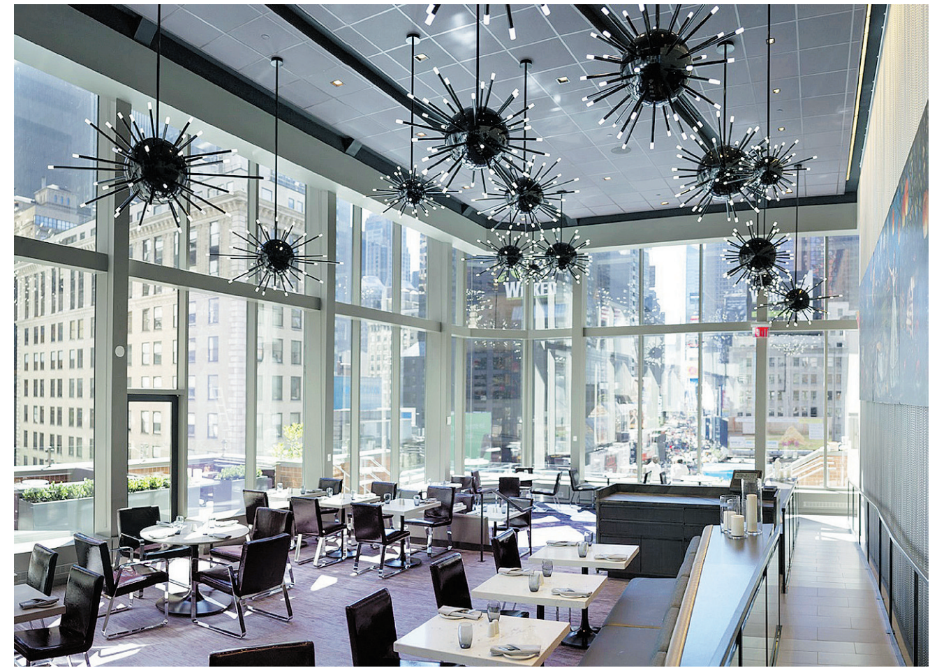
Novotel New York Times Square, with its panoramic windows, has been rebuilt with the theme of New Year's Eve.

SuperNova's food is a family-friendly update on American comfort cuisine: braised short ribs, roast chicken, lobster mac 'n' One outstanding feature cheese, grilled fish and steak, is Novotel's interactive e- meat loaf, crab cakes, seafood jambalaya, burgers and dogs, plus a few modern dishes there are 395 worldwide, insuch as tuna cured in ginger cluding seven in Canada. citrus dressing and fries with Here, we have Novotel Mont-